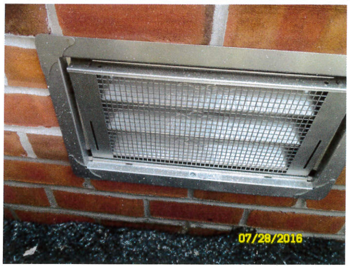
Vent View – Date of Photograph: (See Photo Stamp)